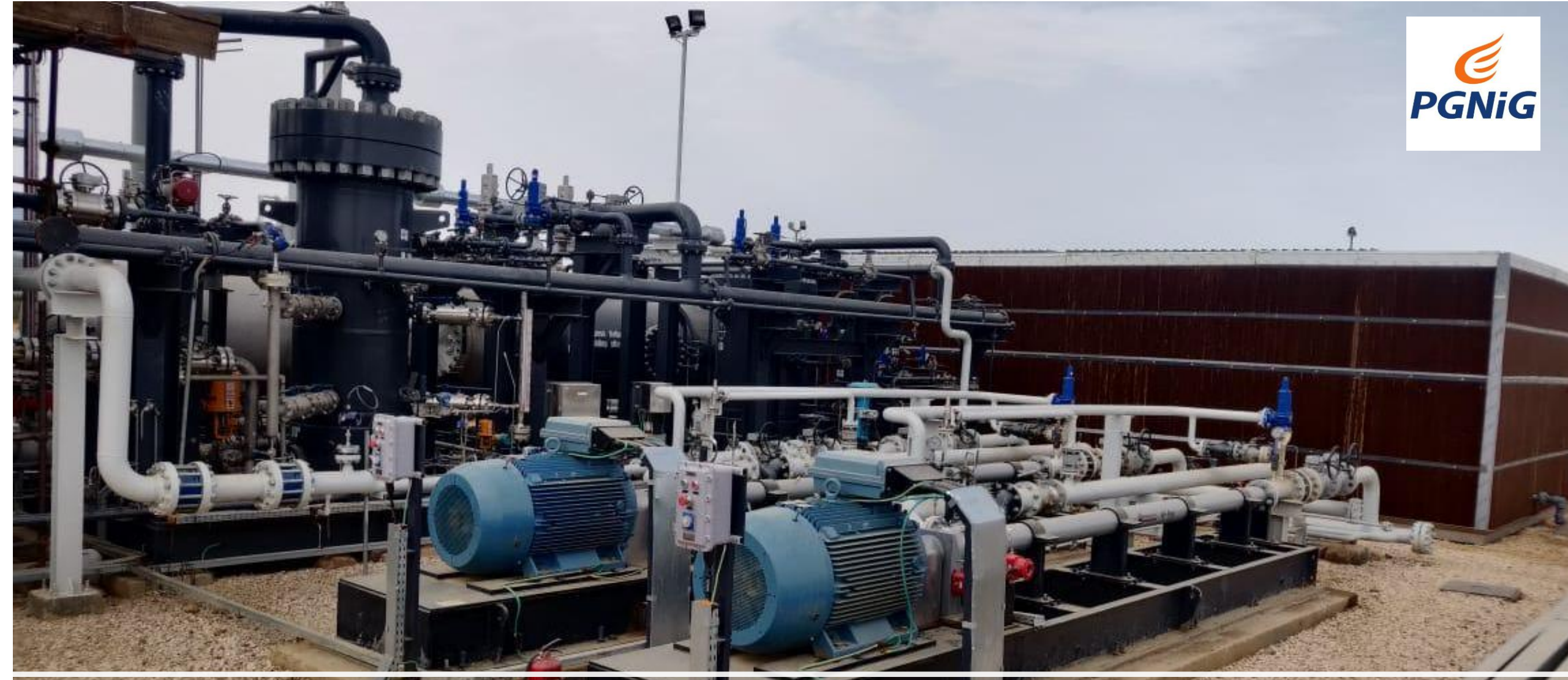
Structure design and fabrication for gas combustion chiller at Dadu Gas Field